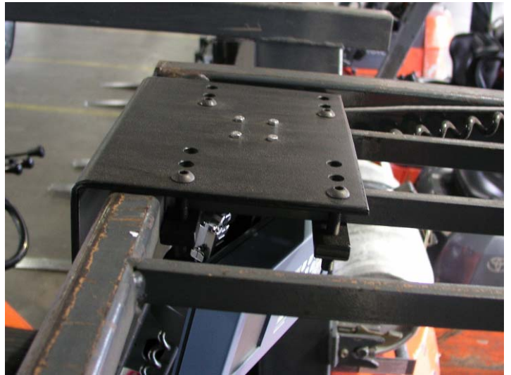
t700 "Standard" Mounting Bracket – Drivers View