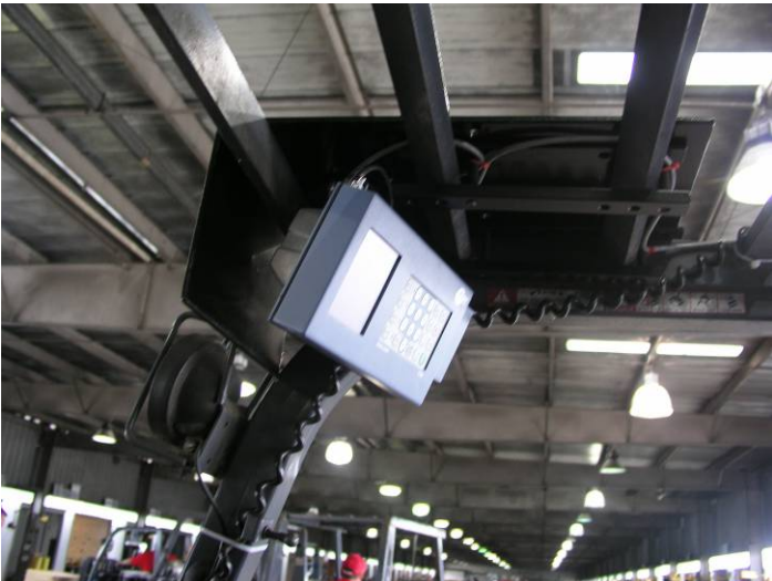
t700 - "XL" Bracket for Left to Right Style Cages