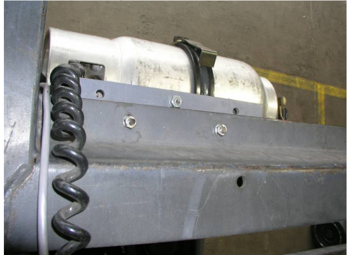
WI-125 “Z-Bar” Mount – Top View

Note: Two Holes are added to the Standard Weigh-Tronix 125 top mounting plate to affix it to the “Z-Bar” cross member.