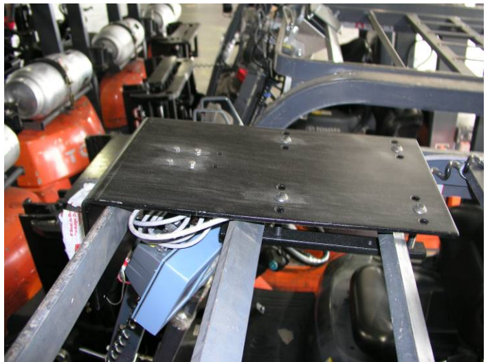
t700 – “XL” Bracket Top View