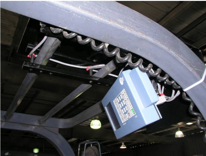
t700 – “XL” Bracket for Left to Right Styled Cages