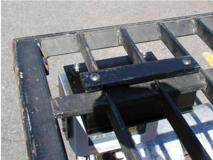
WI-125 Bracket Top View