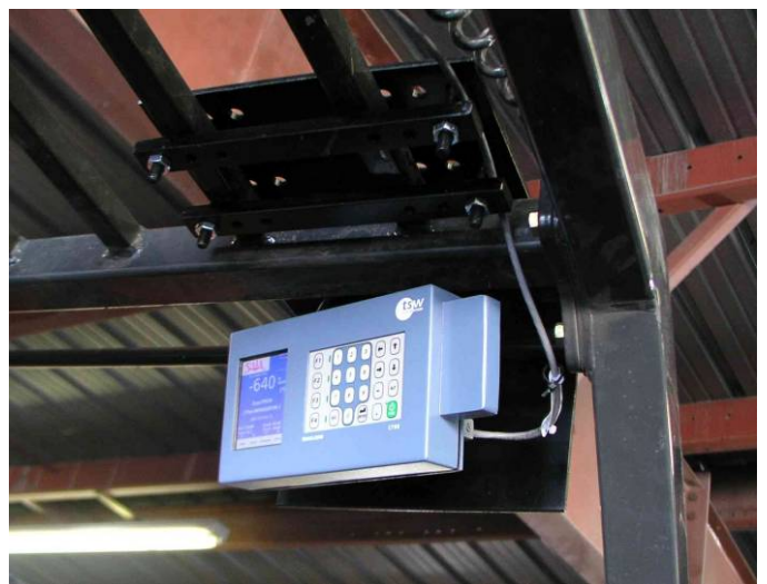
t700 – "ML" (Medium Length) Mounting Bracket