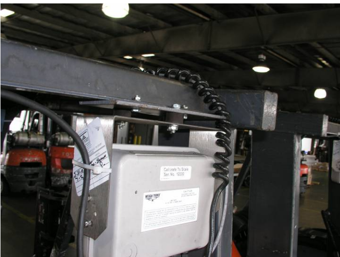
WI-125 “Z-Bar” Back Bracket Mounting Style