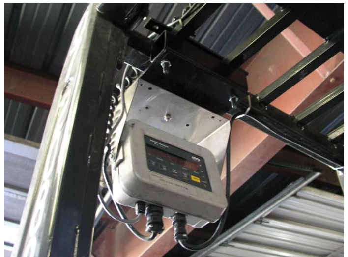
WI-125 Rear Mount Adjustable Bracket