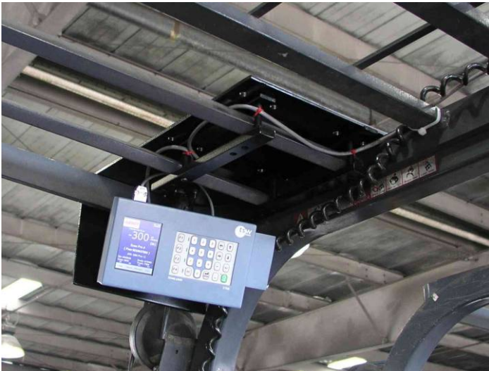
t700 – “XL” Bracket Lift Truck Drivers View