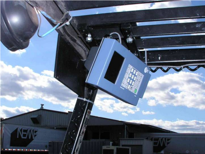
t700 Standard Bracket