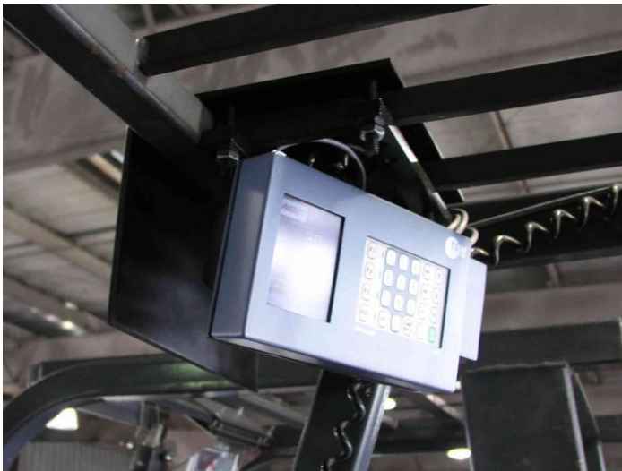
t700 "Standard" Mounting Bracket – Drivers View