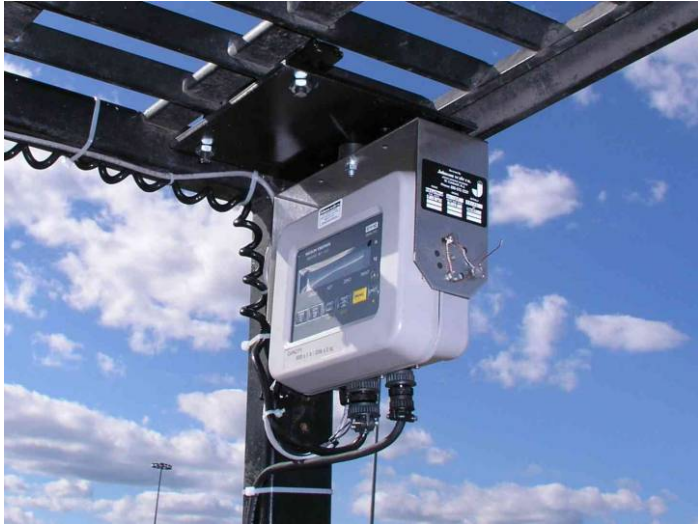
WI-125 Mounting Bracket