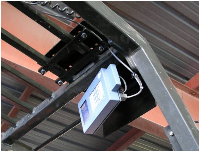
t700 – "ML" (Medium Length) Mounting Bracket