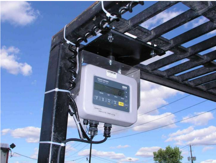
WI-125 Mounting Bracket