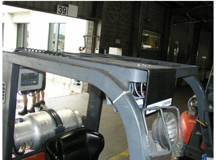
t700 – “XL” Bracket Outside View