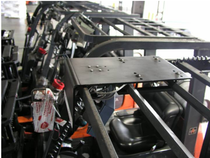
t700-"XL" Bracket - Top View